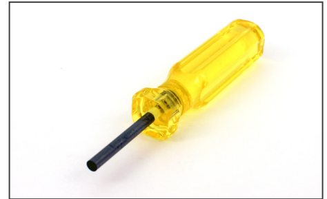
Weatherpack Pin Removal Tool Part #1000-1110

This tool features a ratcheting device to accurately hold and grip wire terminals from 14–20 AWG gauge size.