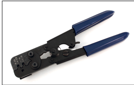
Weatherpack Pin Crimper Tool Part #1000-1100

The 2.4" color monitor allows you to visually inspect hard to reach areas. Four bright LED lights on a 40" cable with TV/video jack.