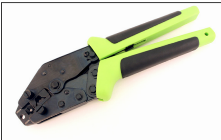
Spark Plug Wire Crimper Tool Part #1000-1120

This tool allows easy removal and relocation of Weatherpack style terminals from the connector housing. Fits male/female design.