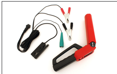
Pro Digital Timing Light Part #1000-1130

This tool properly strips the spark plug wire. Also crimps-on the new plug wire terminals. Includes jaw set.