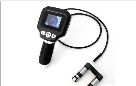
Pro Internal Engine Inspection Camera Part #1000-1140

Professionals know that there is nothing like having the right tool for the job. Crane Cams Ignition has added high quality tools to its product line to assist in your efforts to do the job correctly every time. We all have witnessed the fact that a poor electrical connection will fail at the worst possible time, but having the correct tools will help you to eliminate this problem.